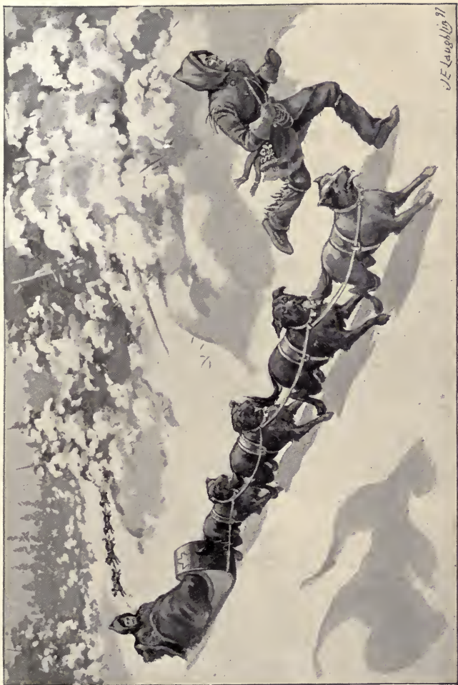
“DOG TRAVELLING WAS NOT WITHOUT ITS PLEASURES.”